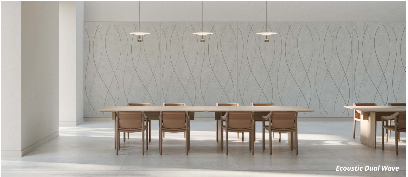
Ecoustic Dual Wave

Rain , designed by Adam Cornish, is inspired by the emotional experience of watching rain, countless water droplets moving at great speed and often skewed by the accompanying wind. Rain aims to capture this dynamic like a delayed shutter speed, the individual droplets transform into streaking geometric lines fading and blending the start and finish of each droplet.